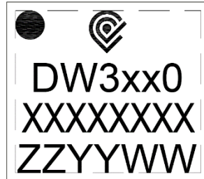
Figure 1 Device Package Markings

The diagram below shows the package markings for DW3210, DW3220, DW3110 and DW3120.